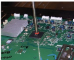
Automated rework and X-ray inspection ensure high yields and excellent quality.